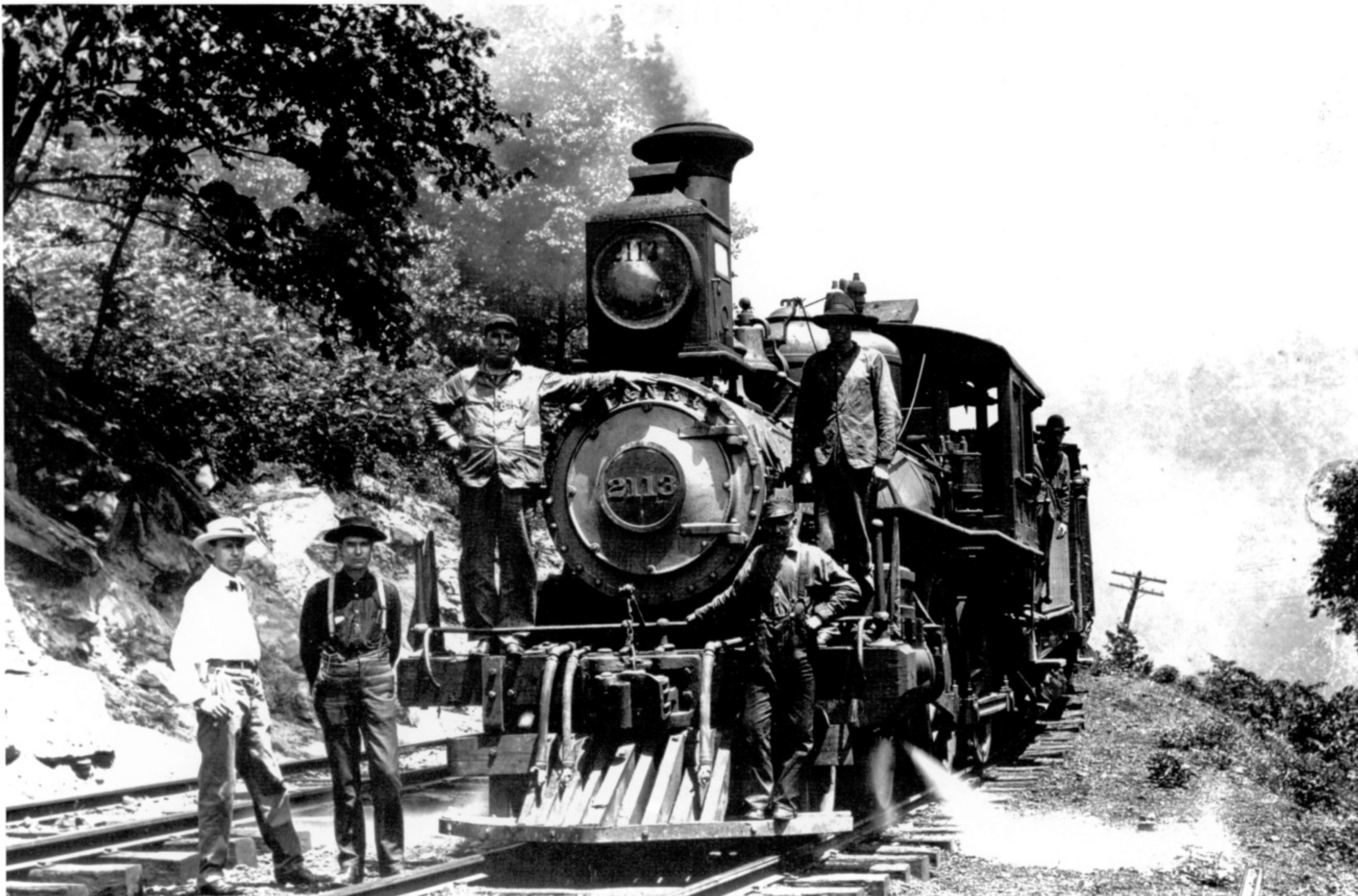
A somber group of gentlemen gathers around Rogers-built D-0 no. 2113 in work train service at Sinks, Kentucky in 1912. The engine flies white flags on both sides of the pilot, denoting this as an extra. Note the cast "L&NRR" on top of the smokebox front.