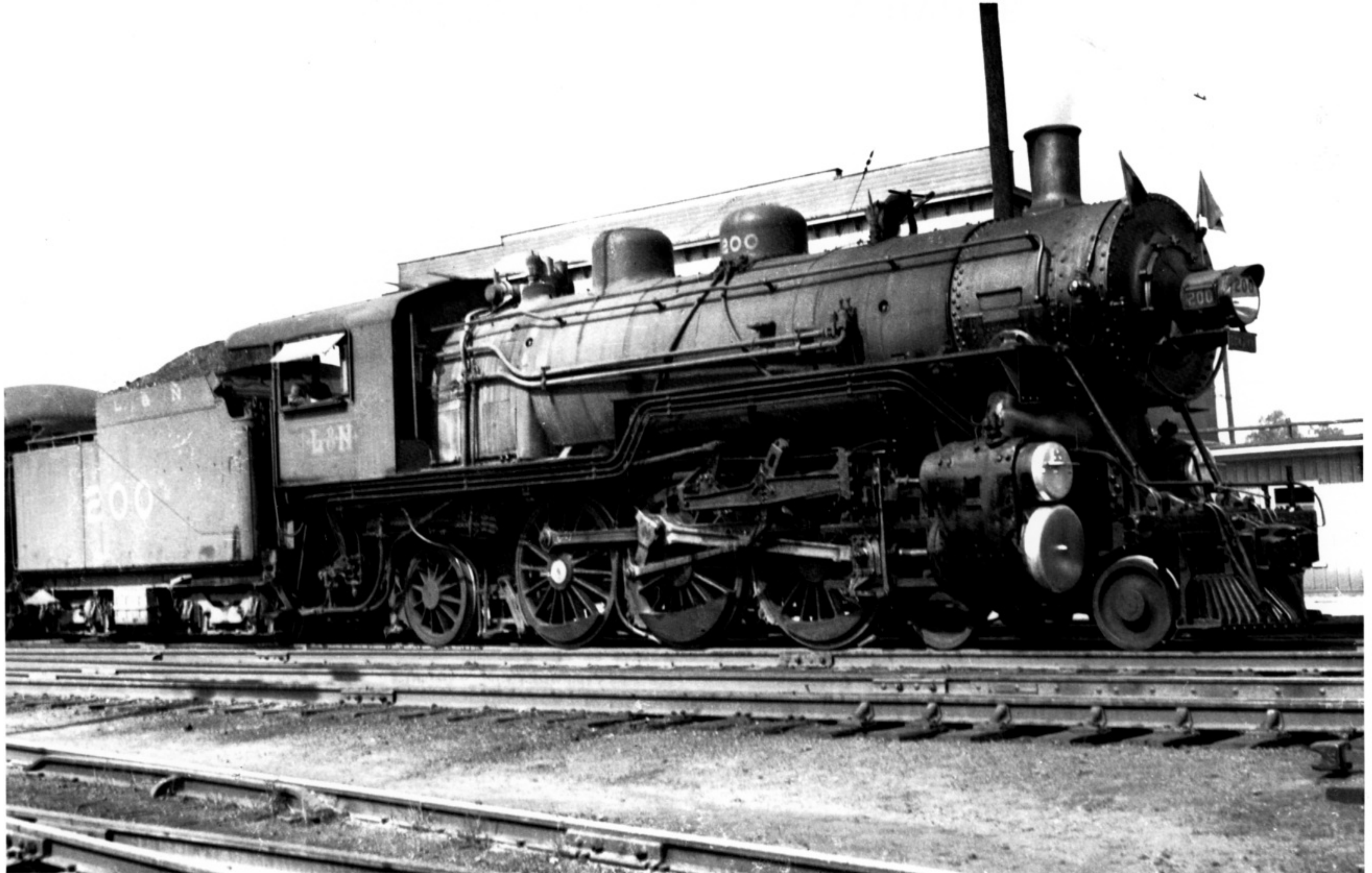
The engineer of K-3 Pacific no. 200 (built by South Louisville Shops in 1912) has the Johnson Bar "in the corner" for a fast getaway. This 1939 scene at Boyles, Alabama also reveals an indication of good things to follow: two green flags above the headlight tell us a following section will be coming.