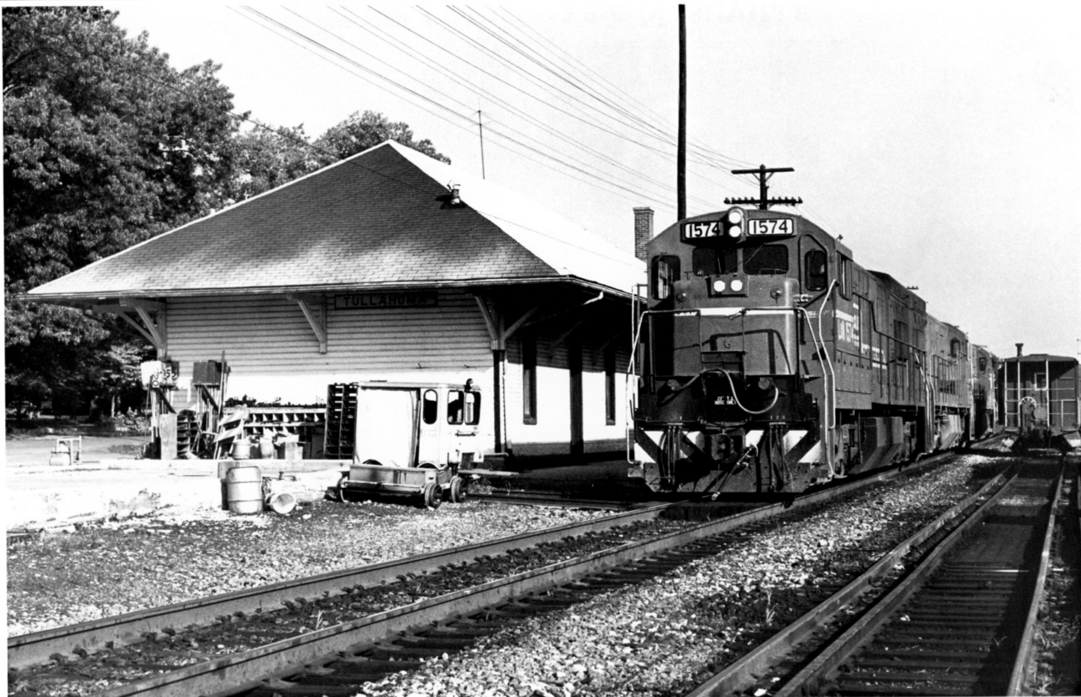
A northbound train headed by GE U30C no. 1574 rolls past the ex-NC&StL depot at Tullahoma, Tennessee on May 12, 1981. The branch to Sparta ventured north from this junction town, and the caboose tucked away on the right was assigned to that run.