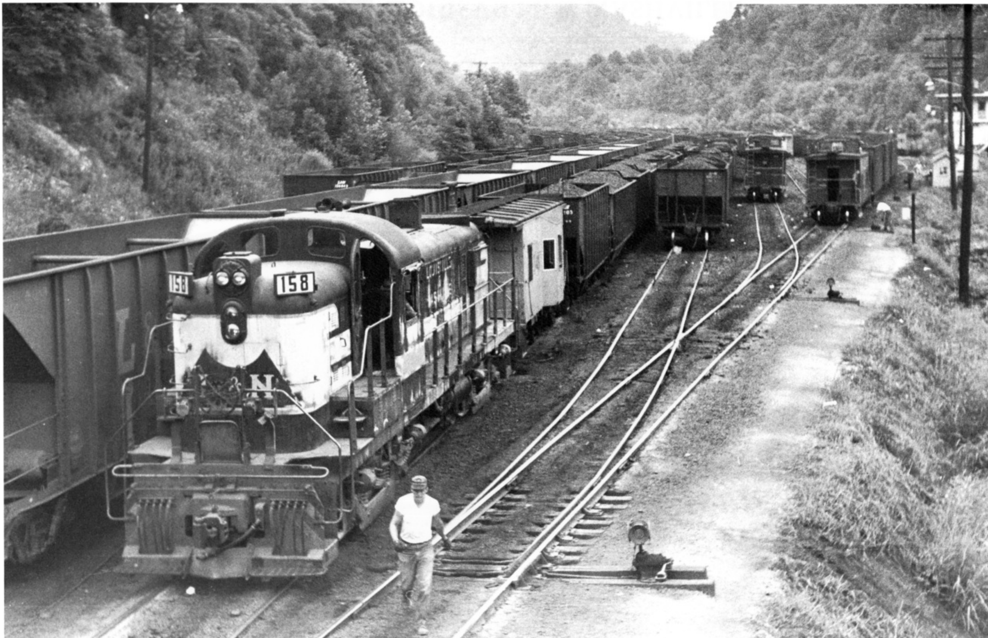
An oppressively hot and muggy August day in the Eastern Kentucky mountains is fast coming to a close. On the 19th day of that month in 1967, RS3 no. 158 finishes making up another coal train at North Hazard, Kentucky.