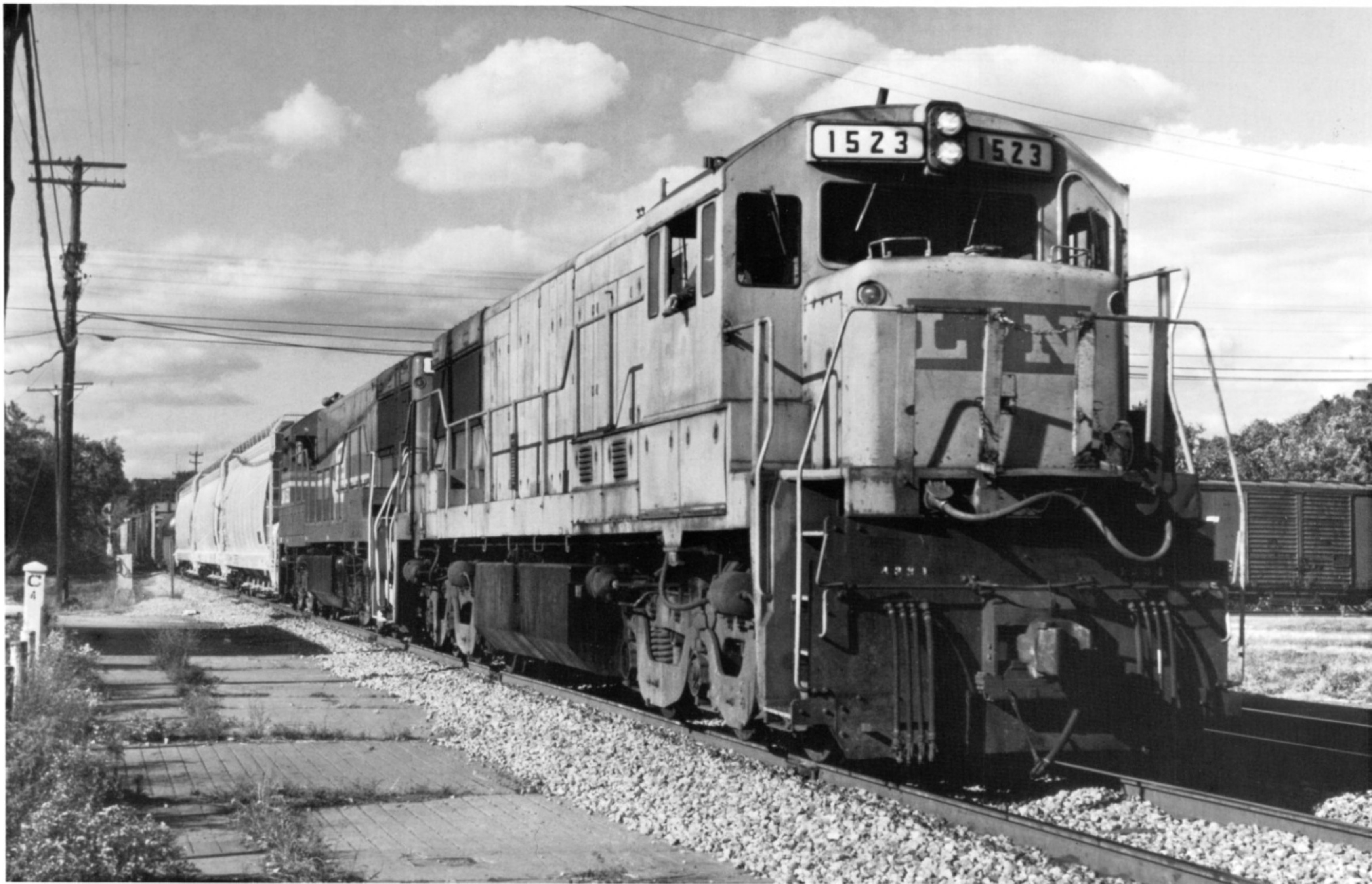
In the twilight of their lives, burly U25C 1523 and a sister handle a B&O to L&N transfer run at Latonia, Kentucky on a beautiful October 12, 1980.