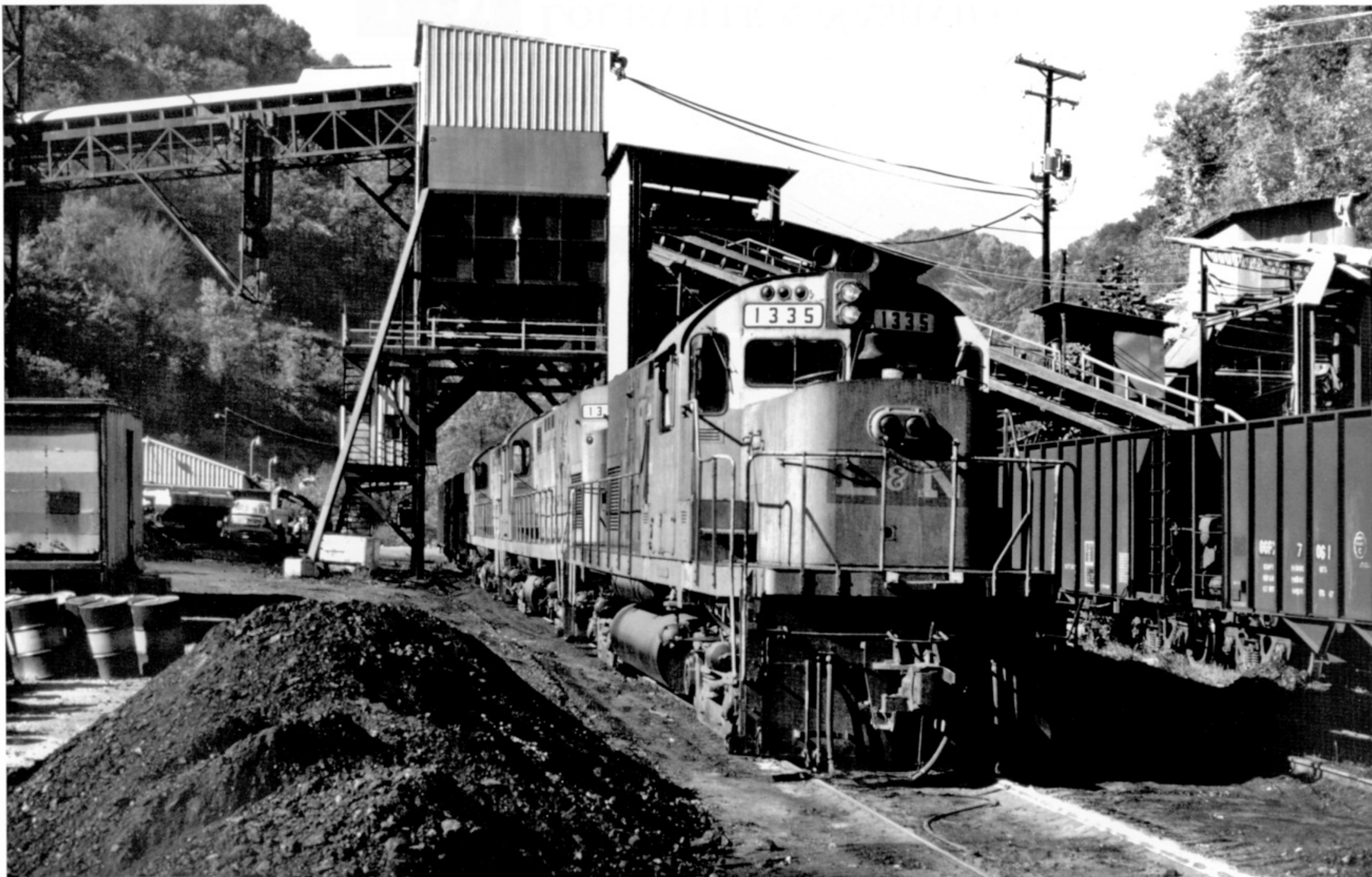
On October 11, 1980, Alco C420s 1335, 1351 and 1355 ease a mine run under the loadout at Lost Mining, Inc. The location is near the community of Bulan, Kentucky, on the Eastern Kentucky Subdivision.