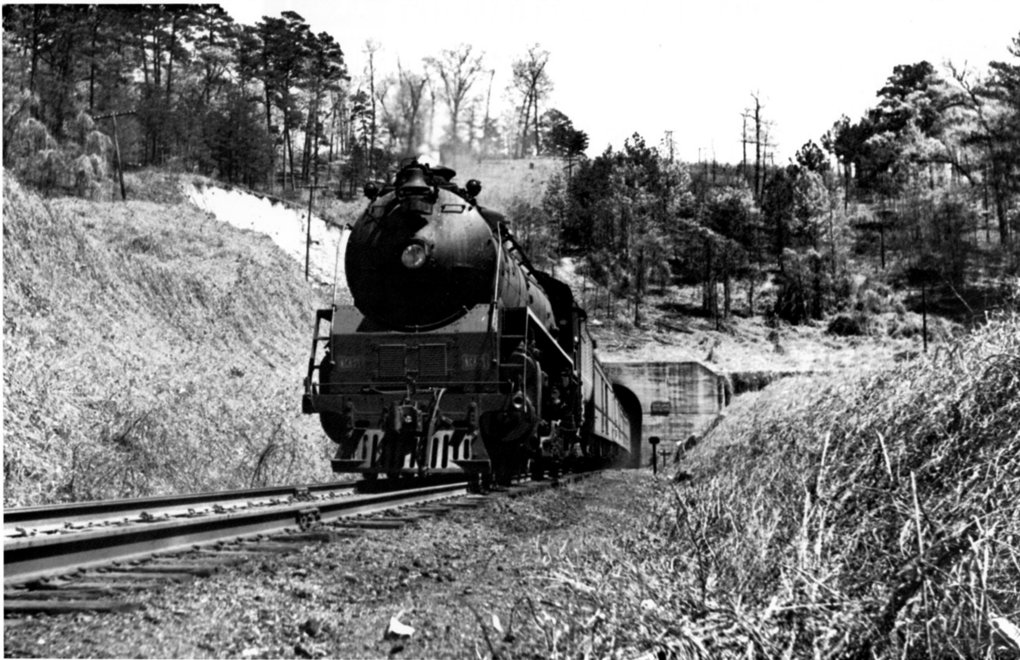
With a faint haze of exhaust above the stack, NC&StL J-3 "Stripe" no. 587 rolls the northbound Dixie Flyer through aptly-named Tunnel Hill, Georgia on April 17, 1948. This bore replaced an older tunnel (out of sight to the right) in use when the Western & Atlantic's Texas pursued the General through here in 1862.