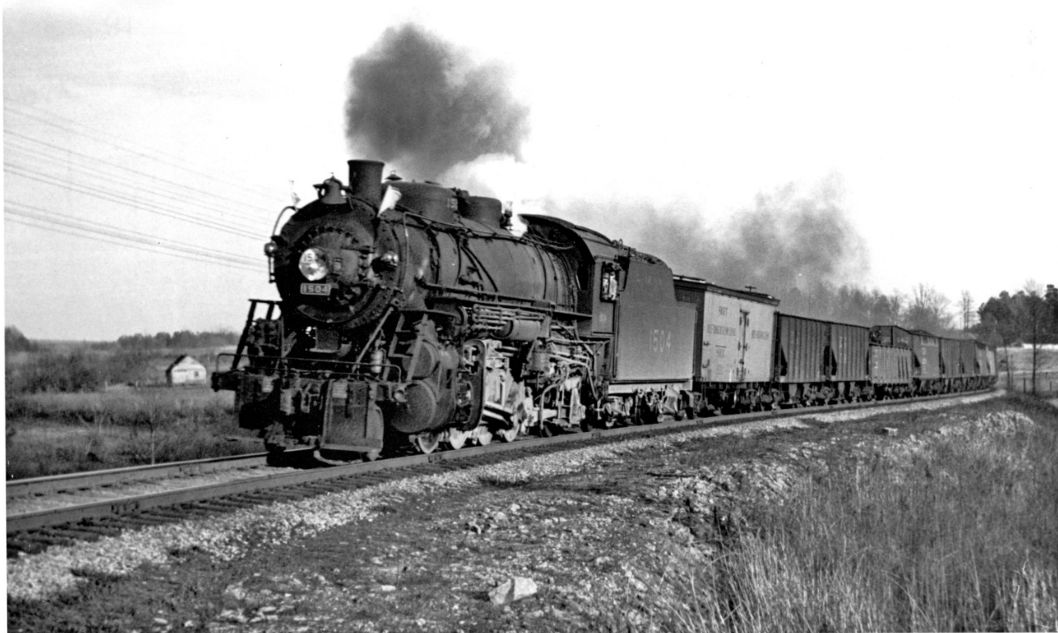
On March 15, 1947, J-3 2-8-2 number 1504 leads a northbound Knoxville & Atlanta Division freight through Marietta, Georgia, on trackage rights over the NC&StL.