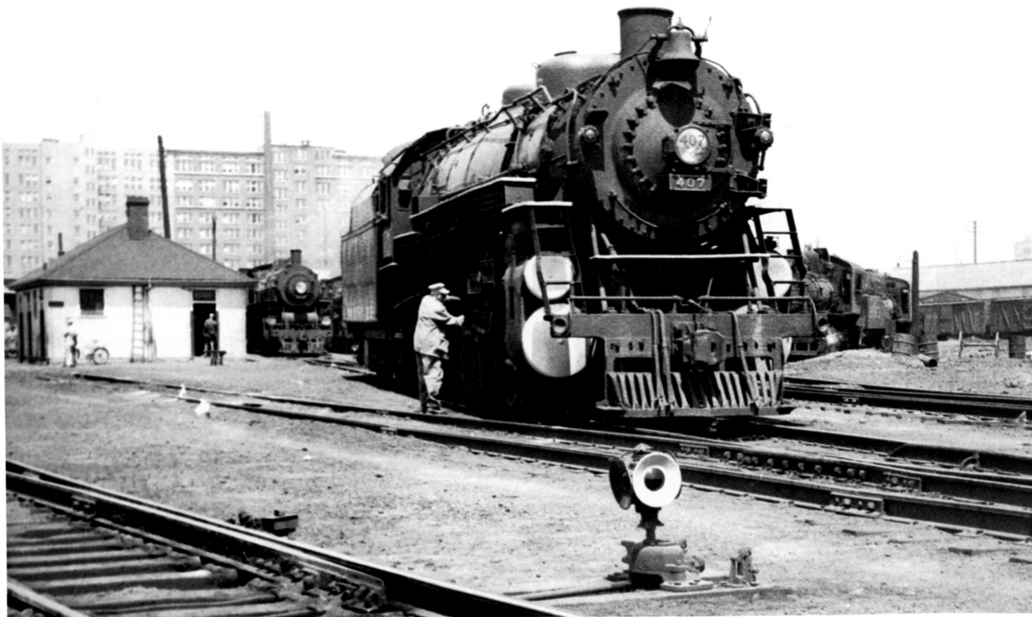
Around noon each day at Louisville's 10th Street "Roundhouse," several engines from L&N's steam fleet would congregate. In this circa 1950 scene, L-1 Mountain no. 407 gets a shot of lube oil from her hoghead. Behind, we see a K-4 Pacific (left), an unidentified engine, and two 0-6-0's (right).