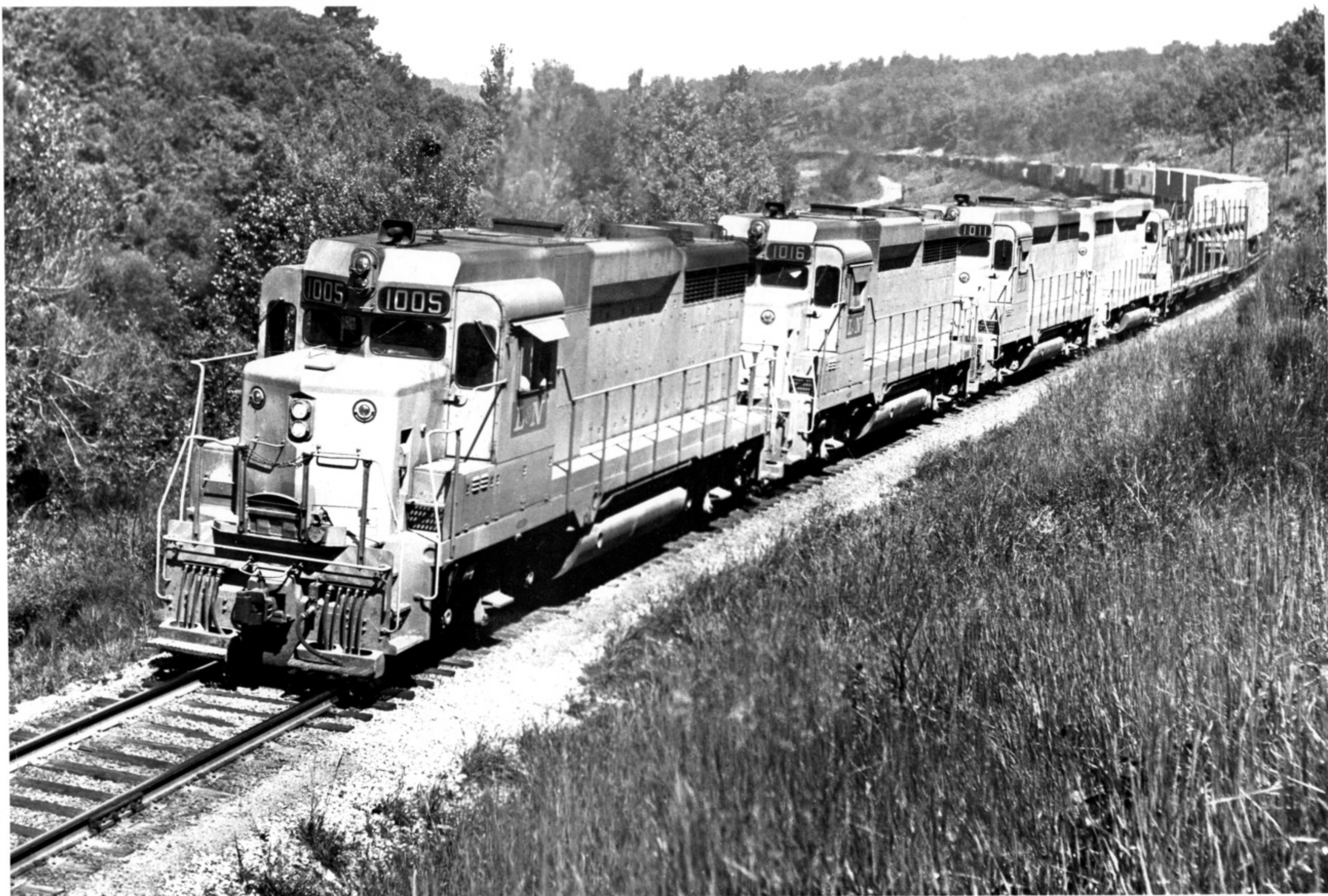
Nearly-new GP30's 1005 / 1016 / 1011 and 1010 have a southbound manifest freight in tow about three miles north of Tullahoma, Tennessee in August 1963.