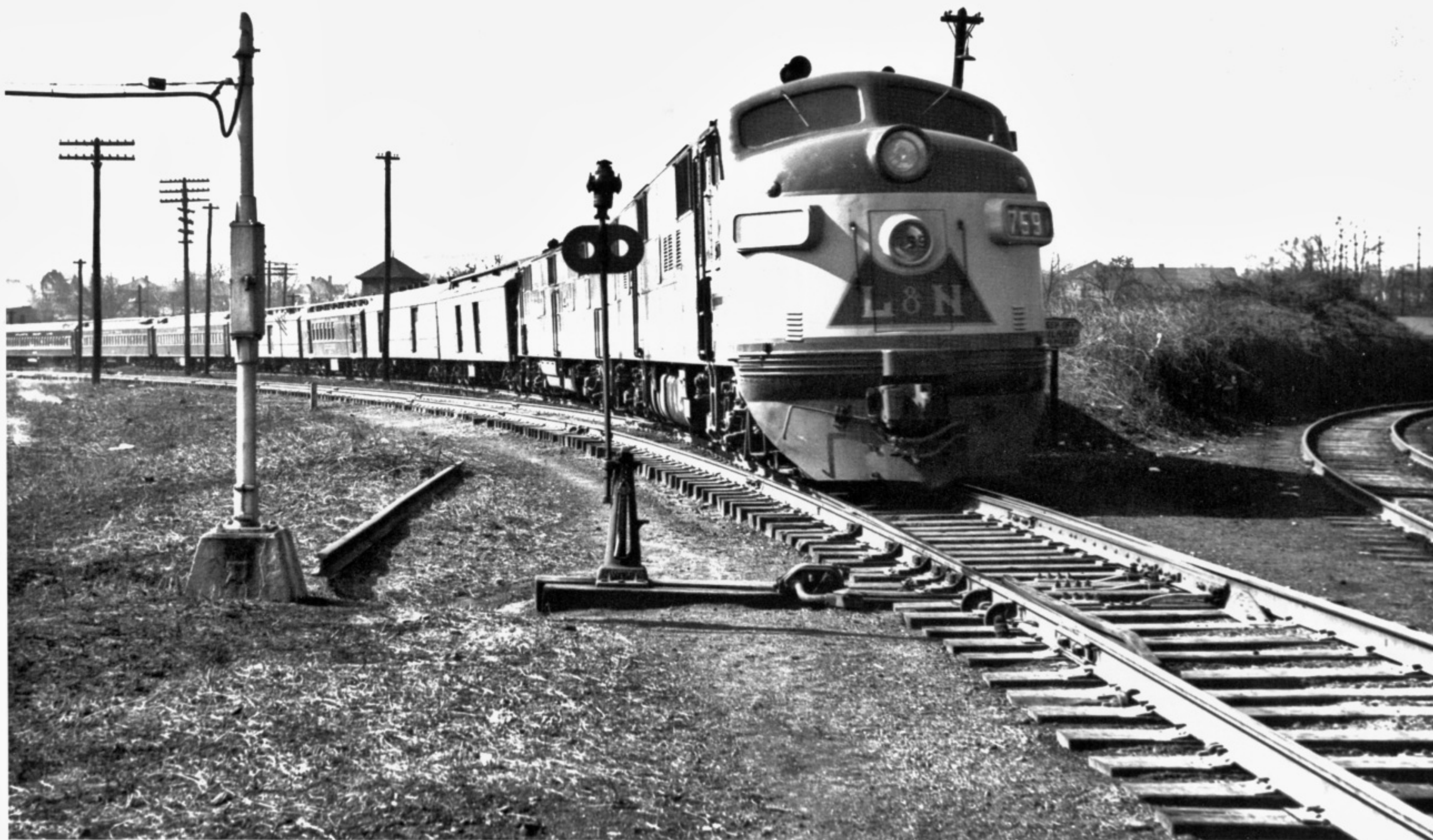
Train 33, the southbound Southland , rolls through West Knoxville, Tennessee in 1952. When the train's rear sleeper clears the wye switch, the E7/E6 duo will back no. 33 to the Knoxville passenger depot.