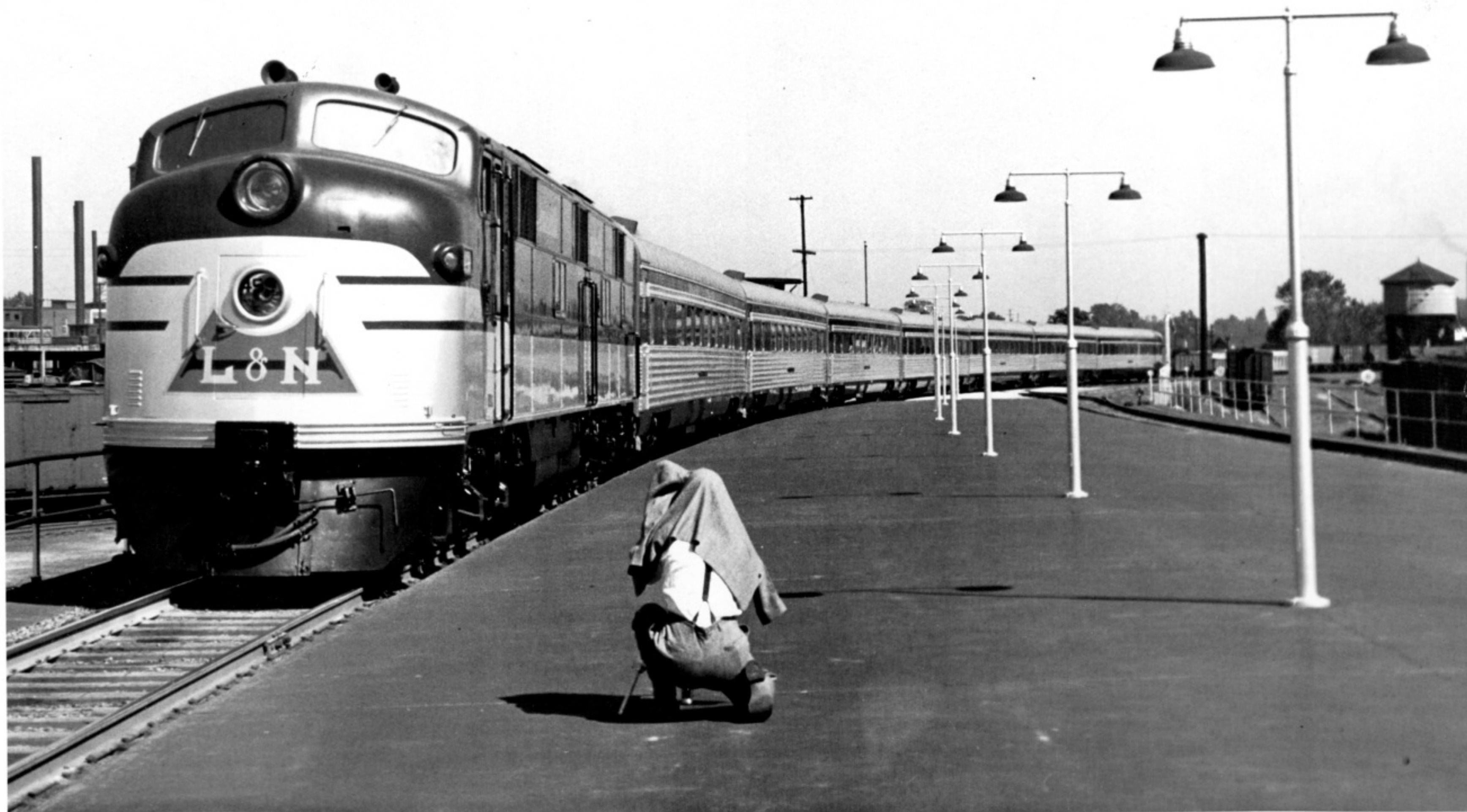
L&N's 1946 streamliner, the Humming Bird , smiles for the company photographer in this view at the Baxter Avenue Station in East Louisville shortly before the train entered regular service. Stretched out behind blue and silver mist E7 no. 459 is a gleaming seven-car string of new cars from American Car & Foundry.