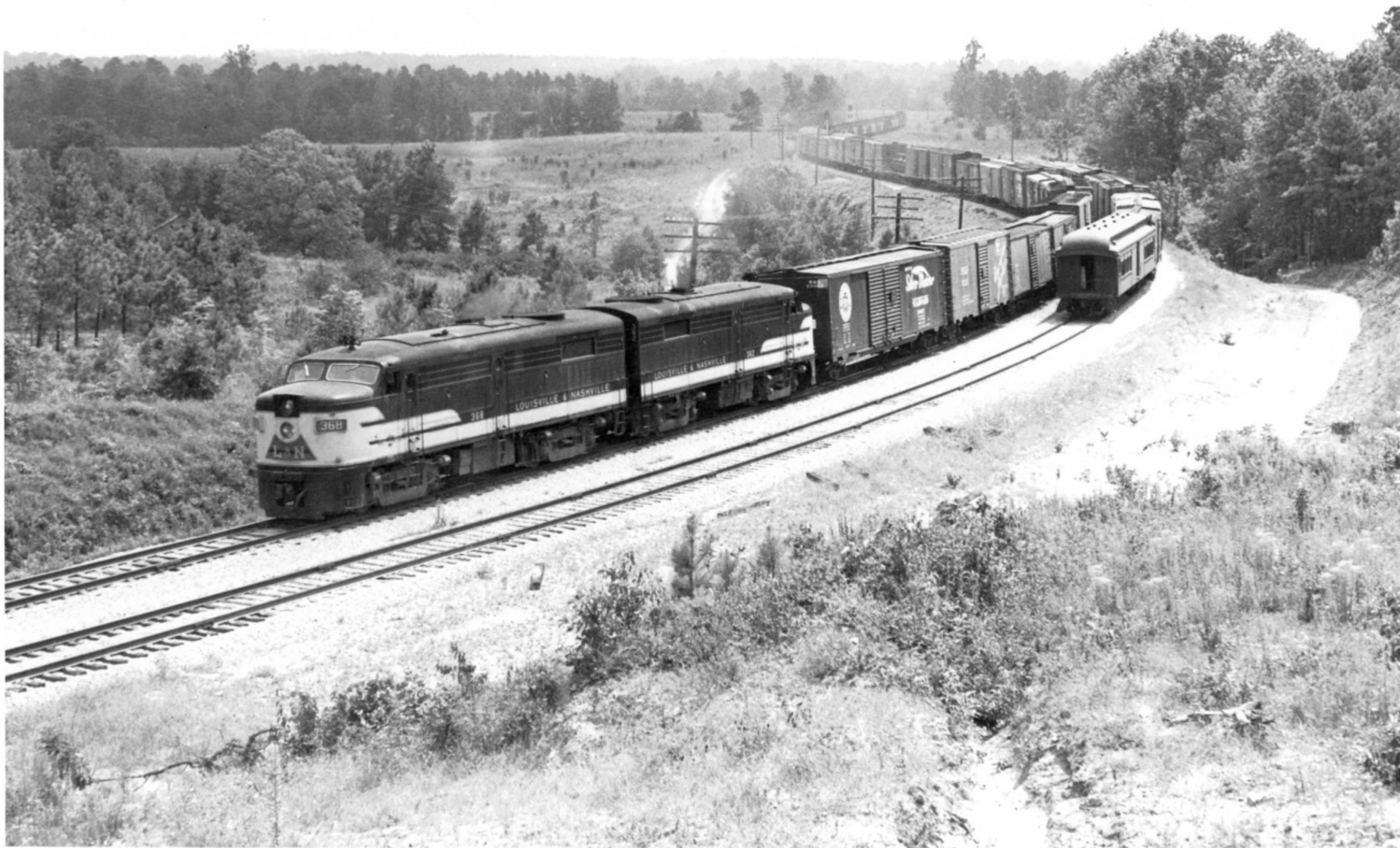
On August 15, 1953, a mixed train stands in the clear at Kennesaw, Georgia for northbound Atlanta-Cincinnati fast freight no. 42 (behind a pair of FA2s). This is NC&StL trackage, but four years later will find the tenant turned to owner.