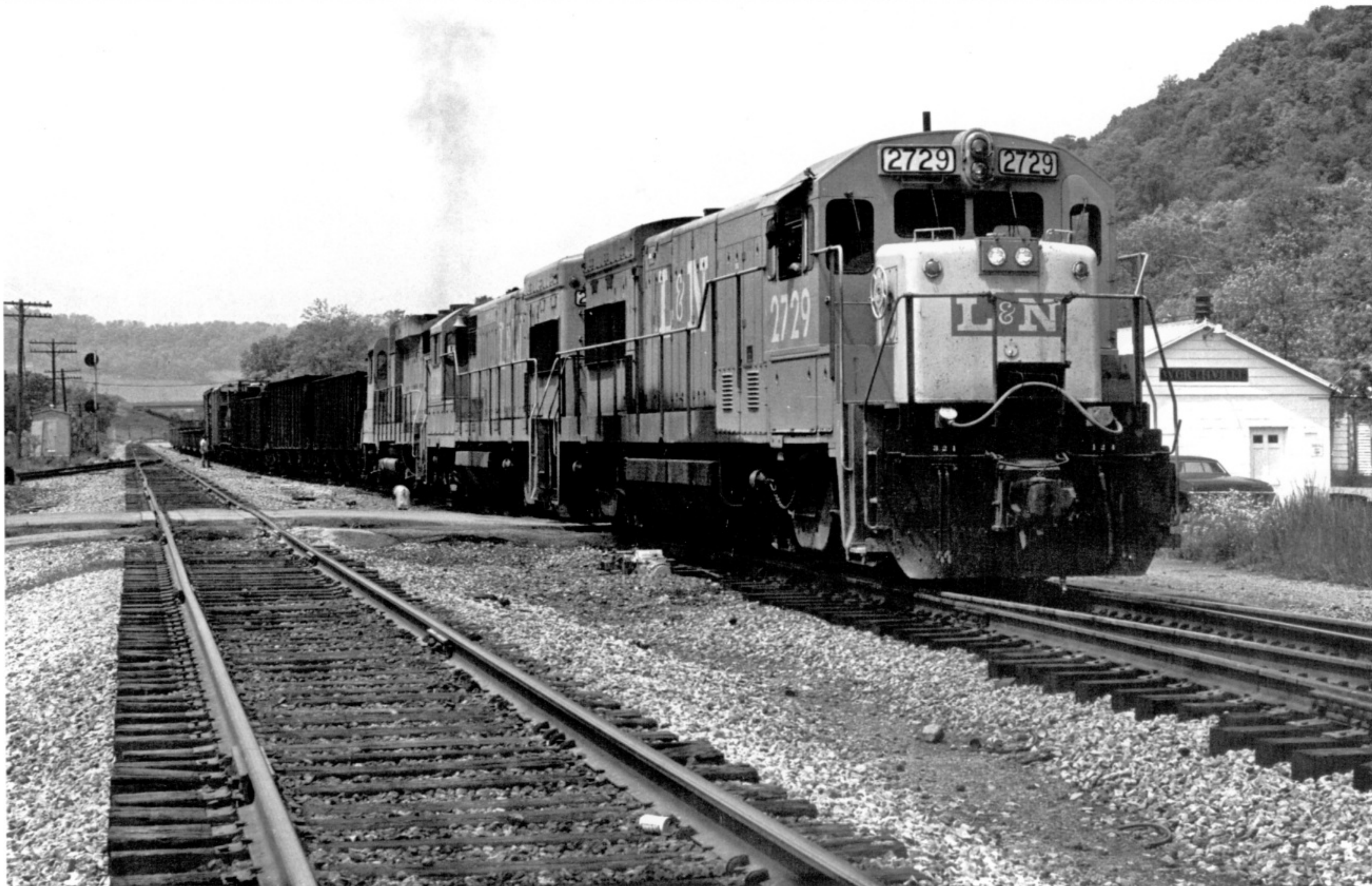
Two U23Bs and a GP30 shuffle cars at Worthville, Kentucky on May 20, 1979. The original depot was replaced by the block structure on the right. Worthville was the junction with the Carrollton Railroad.