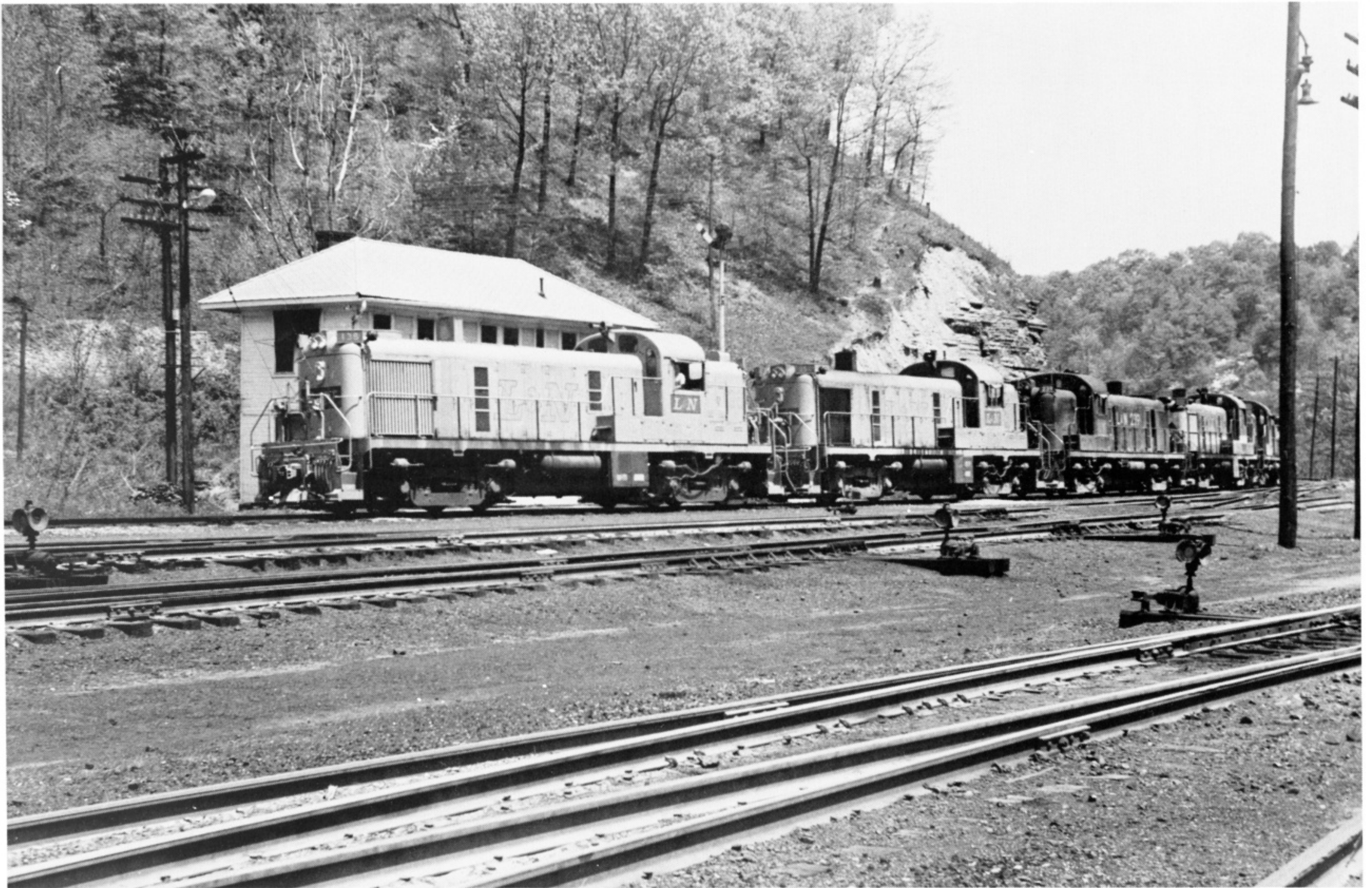
L&N's RS3s were noted for their versatility, handling mine runs and fast freights with equal efficiency. On August 3, 1965 five of the veteran Alcos sail by the two-story yard office at Loyall, Kentucky with Norton, Virginia-Corbin, Kentucky manifest No. 66. The RS3s are sporting no less than three different paint schemes. (Ron Flanary)