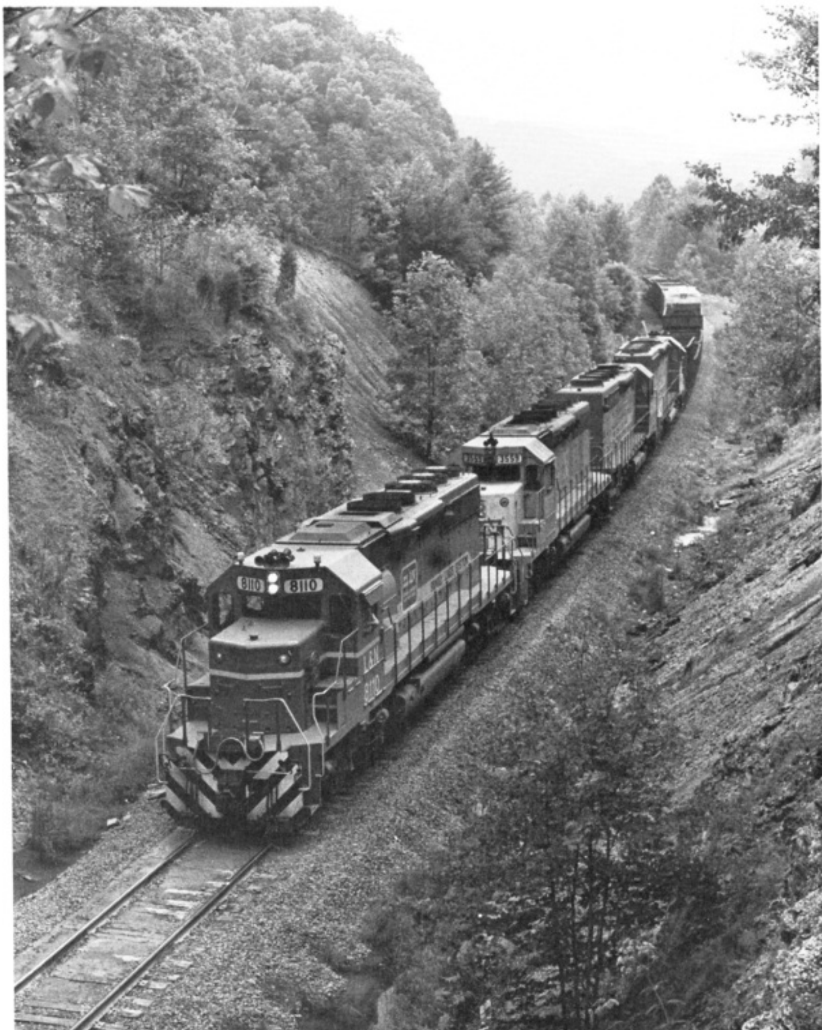
After doubling around the switchback at Hagans, Virginia on August 31, 1980, Extra 8110 North prepares to enter the 6,244 foot tunnel under Cumberland Mountain. Within 3,000 feet the train will be in Kentucky. (Jill Oroszi)

The Louisville & Nashville Railroad Historical Society was organized in 1982 for the purpose of collecting, preserving, and sharing information and material relating to the L&N, its predecessors and its successors. The Society is a non-profit educational organization, incorporated in the Commonwealth of Kentucky, and functions strictly with volunteer members serving as Officers.