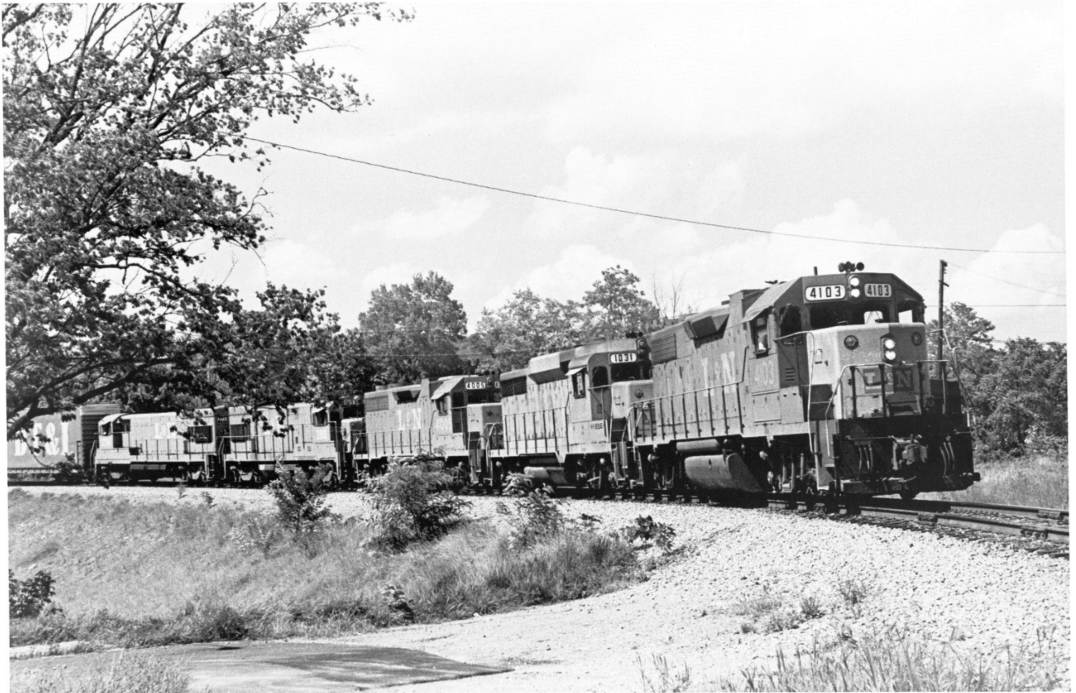
Louisville-DeCoursey trains were obliged to make a hard right turn at Latonia, Kentucky as they veered southward on the KY main to DeCoursey. On October 28, 1977, five gray and yellow four axles are bringing a northbound Short Line fast freight around the wye. (Jill Oroszi)