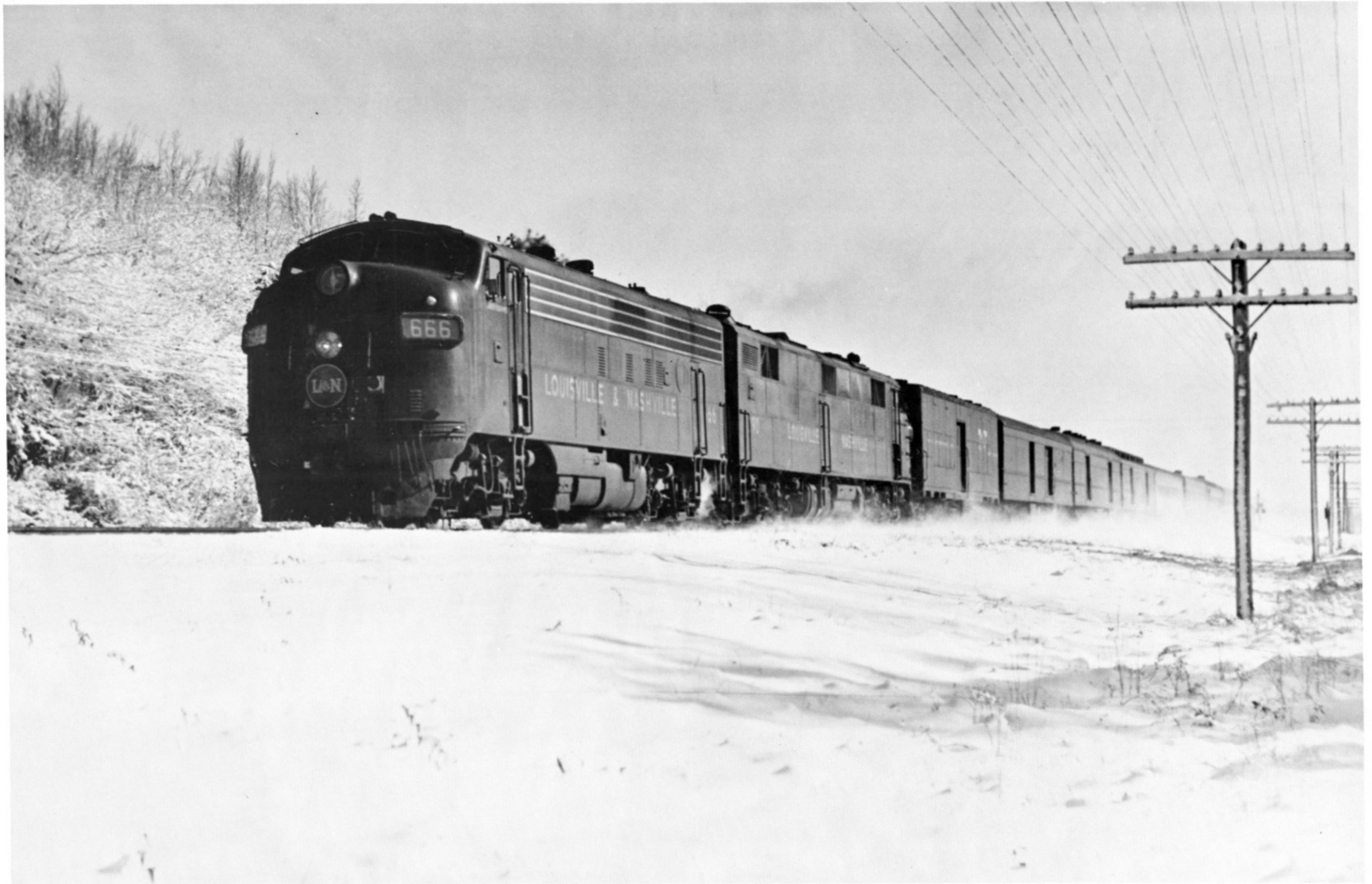
For those who think it never snows in the deep South, witness the southbound Gulf Wind as it roars through a rare blanket of the white stuff near Biloxi, Mississippi in December, 1963. FP7 666 and E7 790 are on the business end of No. 33 this date.