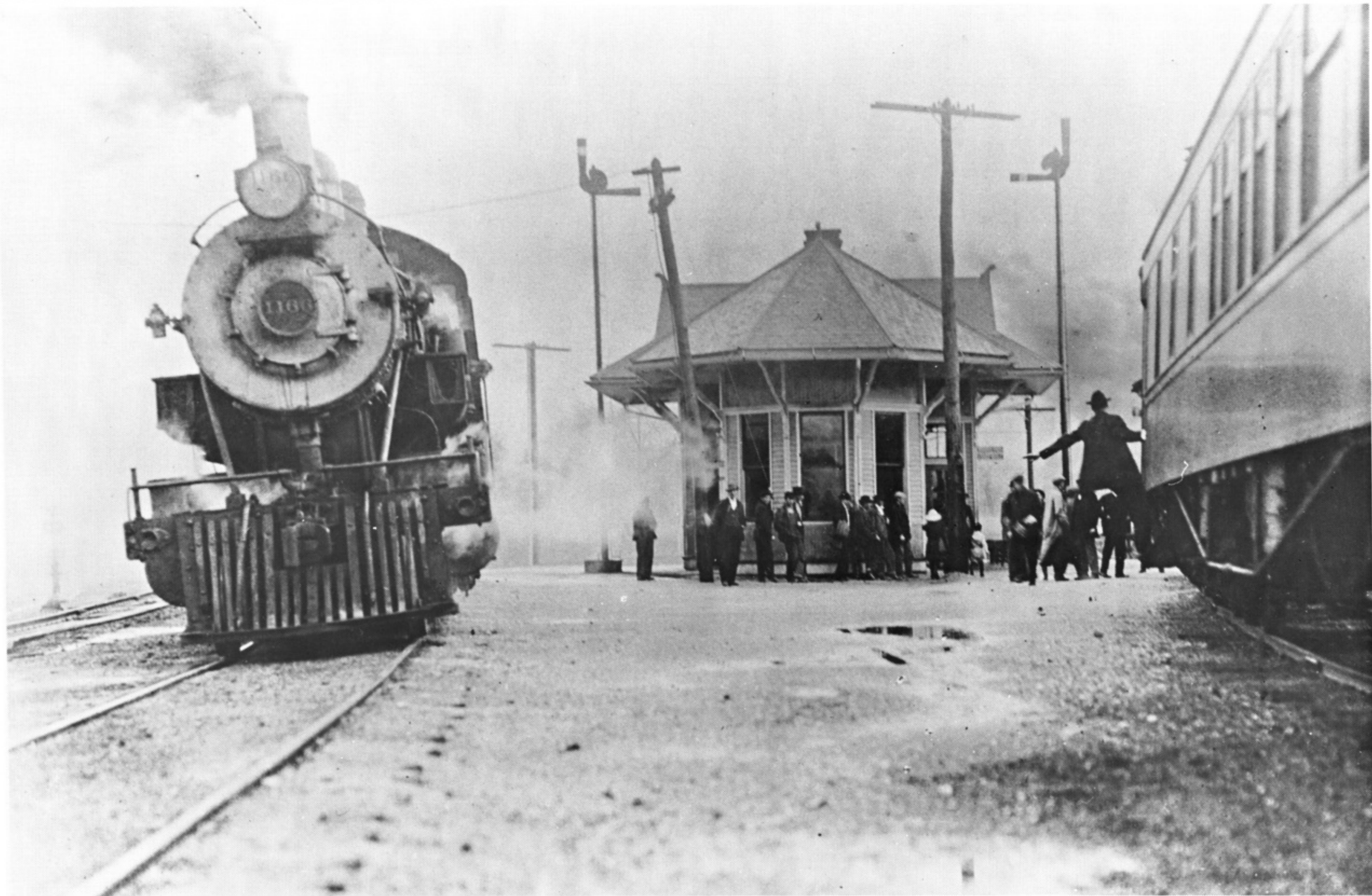
In this undated scene from 1910, passengers and equipment are being shuffled at the junction of L&N's Cow Creek Branch and the Knoxville Division main at Dossett, Tennessee. H23 #1166 has just arrived from Harriman in this scene from L&N's earlier years.