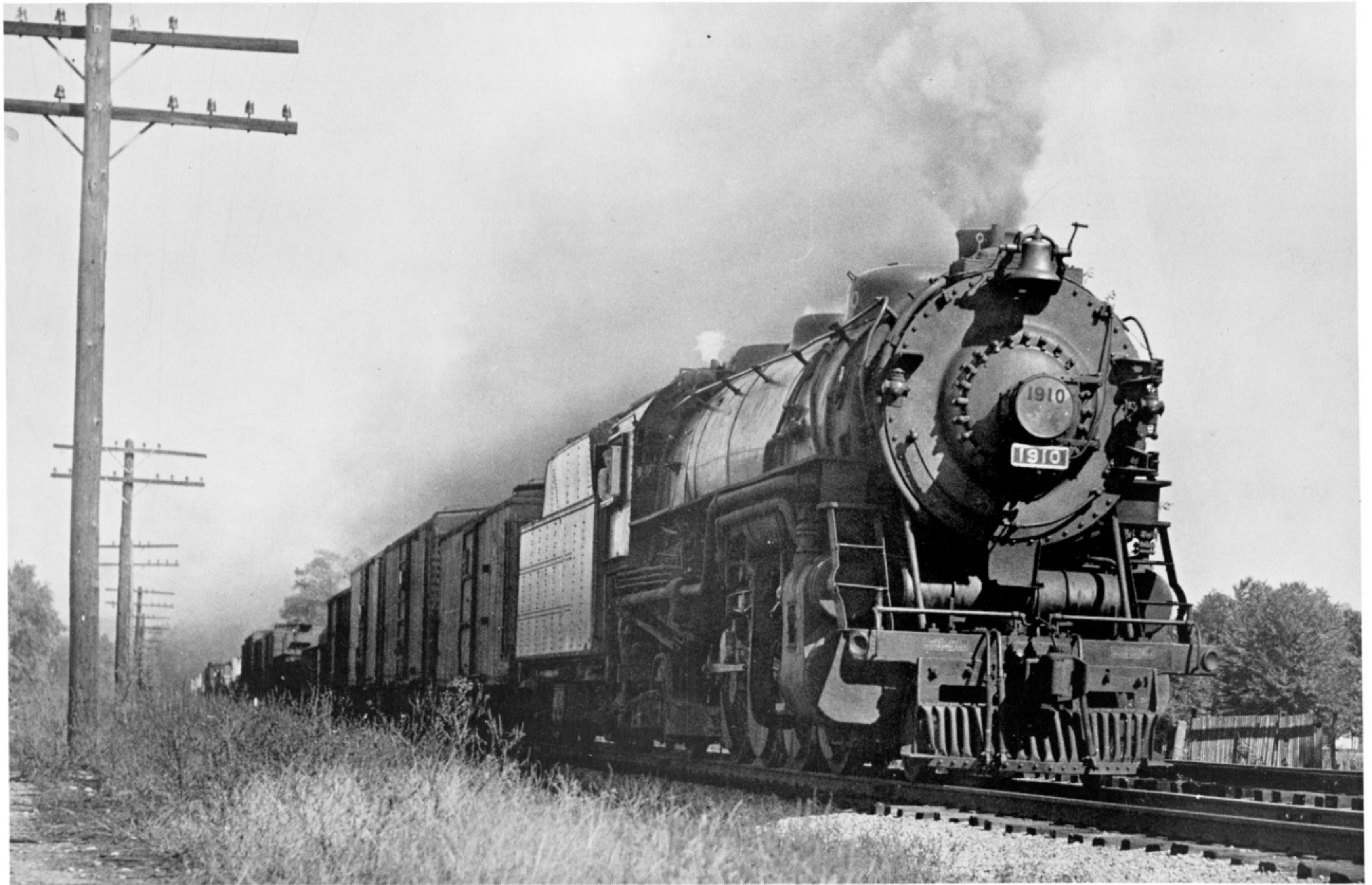
Until the M1 2-8-4s arrived in 1942, L&N's 24 booster-equipped J4As were the "Cadillacs" of the steam fleet. Number 1910 is approaching DeCoursey with a northbound manifest in 1941. The big boilered Mikes were well regarded by L&N engine crews for their ability to handle such assignments with aplomb.