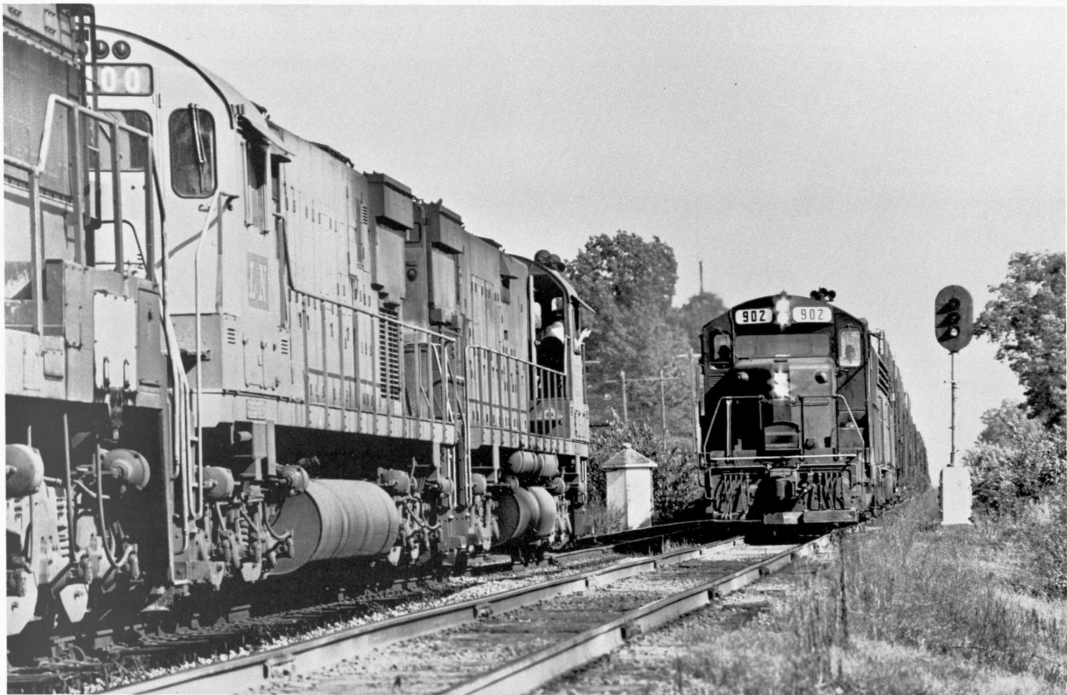
A southbound coal train, powered by two C628s and a U25C, is in the hole at Tullahoma, Tennessee for a northbound empty autorack train led by one of L&N's rare GP18s. When this shot was made in August, 1965, the 902 had just been renumbered from 462 in the major system renumbering that year. The plastic black-on-white numberboards were a by-product of that program.