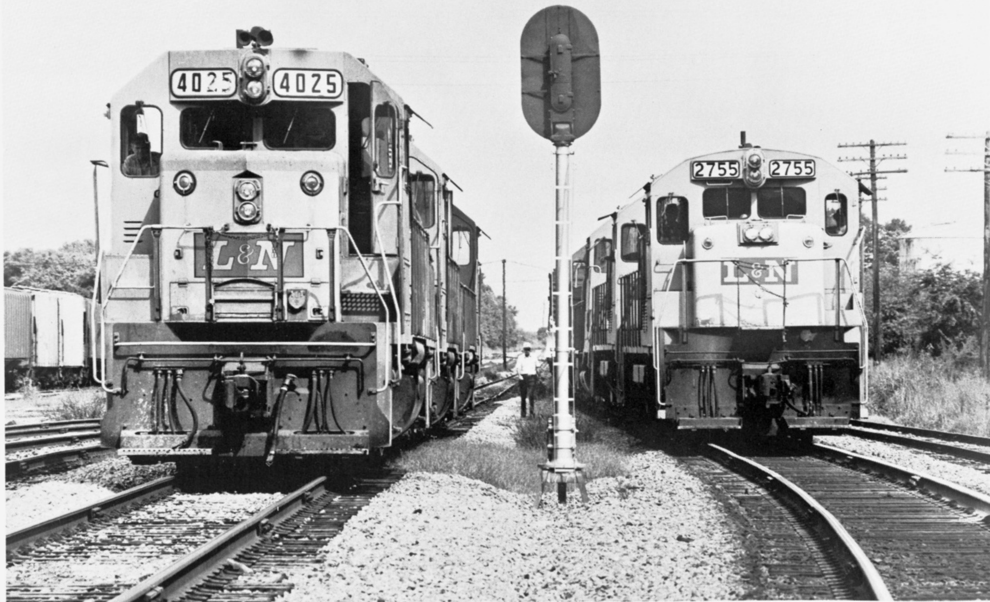
Cowan, Tennessee has been a pusher terminal since rails were first laid across Cumberland Mountain by the Nashville & Chattanooga Railroad in 1853. Carrying on the tradition established by Russian Decapods, dual 2-8-2s, and NC&StL's obscure 2-8-8-2s, three GP38s stand by to give a southbounder, led by U23B 2755, a push up to Cumberland Mountain Tunnel in August 1975.