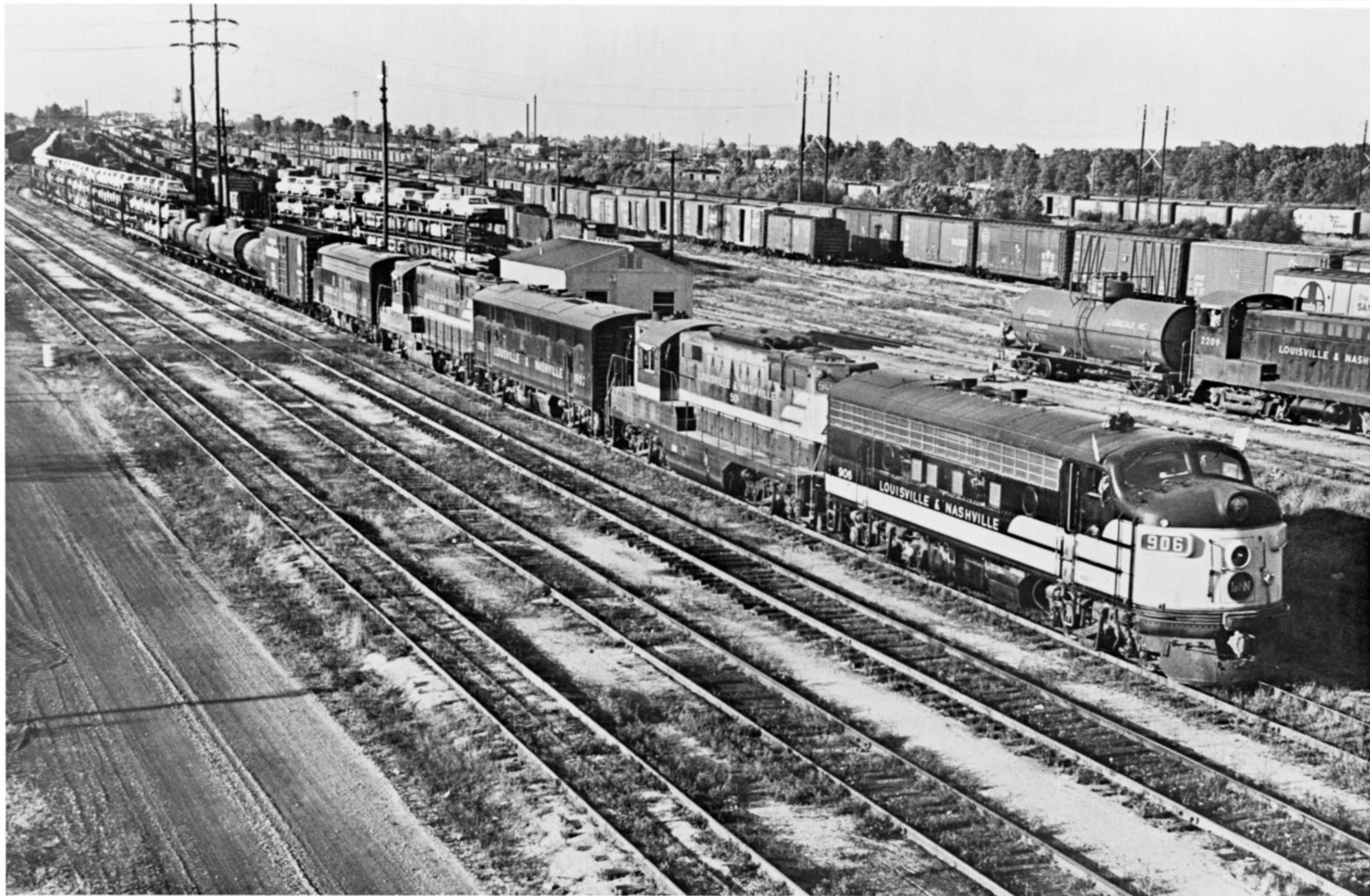
A quintet of EMD hoods and cab units is ready to roll south from Louisville's Strawberry yard on October 5, 1961. Five cars behind the drawbar of the last unit is a long string of loaded tri-level autoracks. L&N was a pioneer in handling auto traffic, recovering much of the finished auto business lost to trucks.