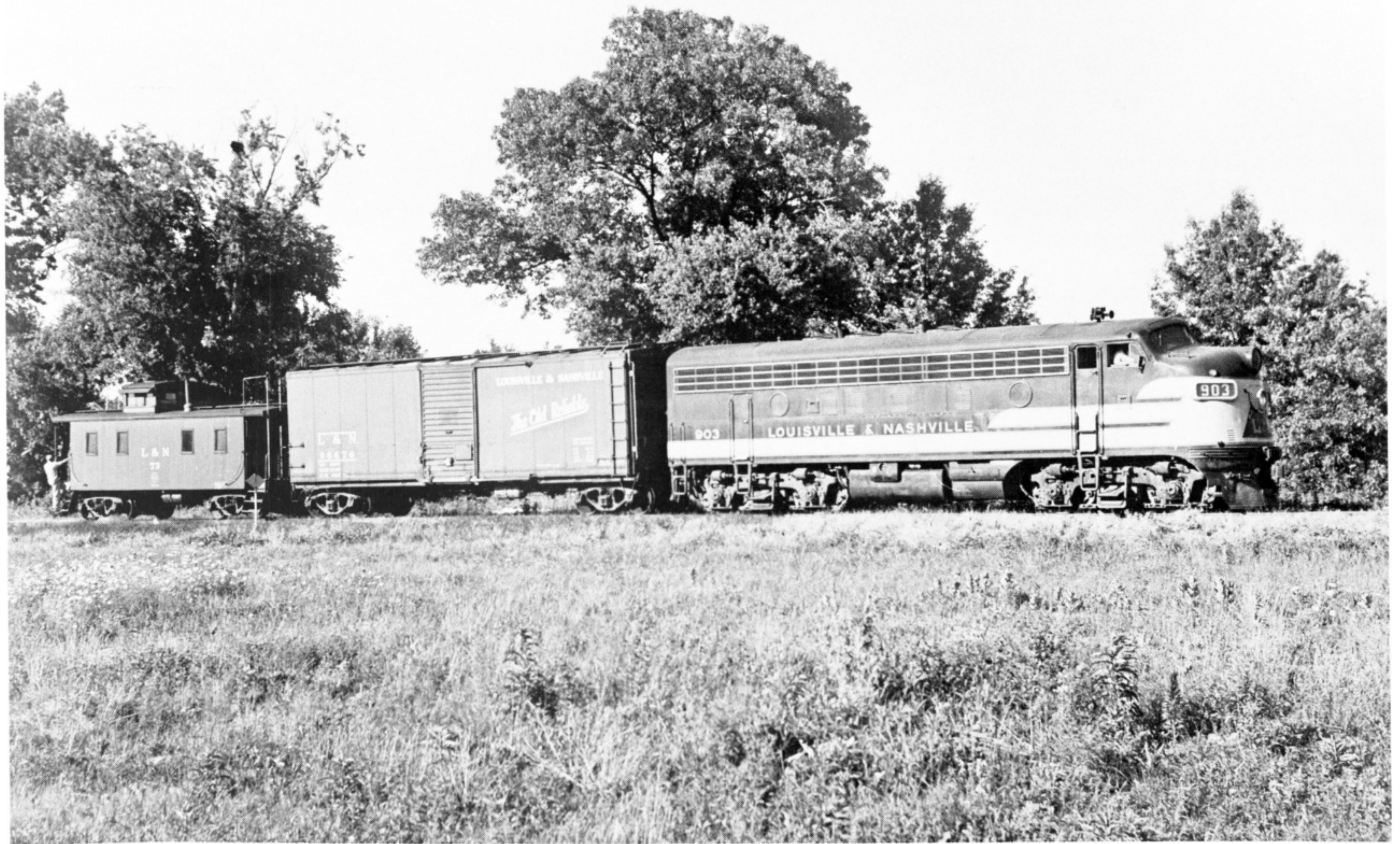
In a bucolic portrait of branchline railroading, F7 903 heads up a one-car local at Eldorado, Illinois in August 1959. The objective for the diminutive freight is Shawneetown. Cab units were ill-suited for such assignments, but apparently a Geep was unavailable this day. (J. Parker Lamb)