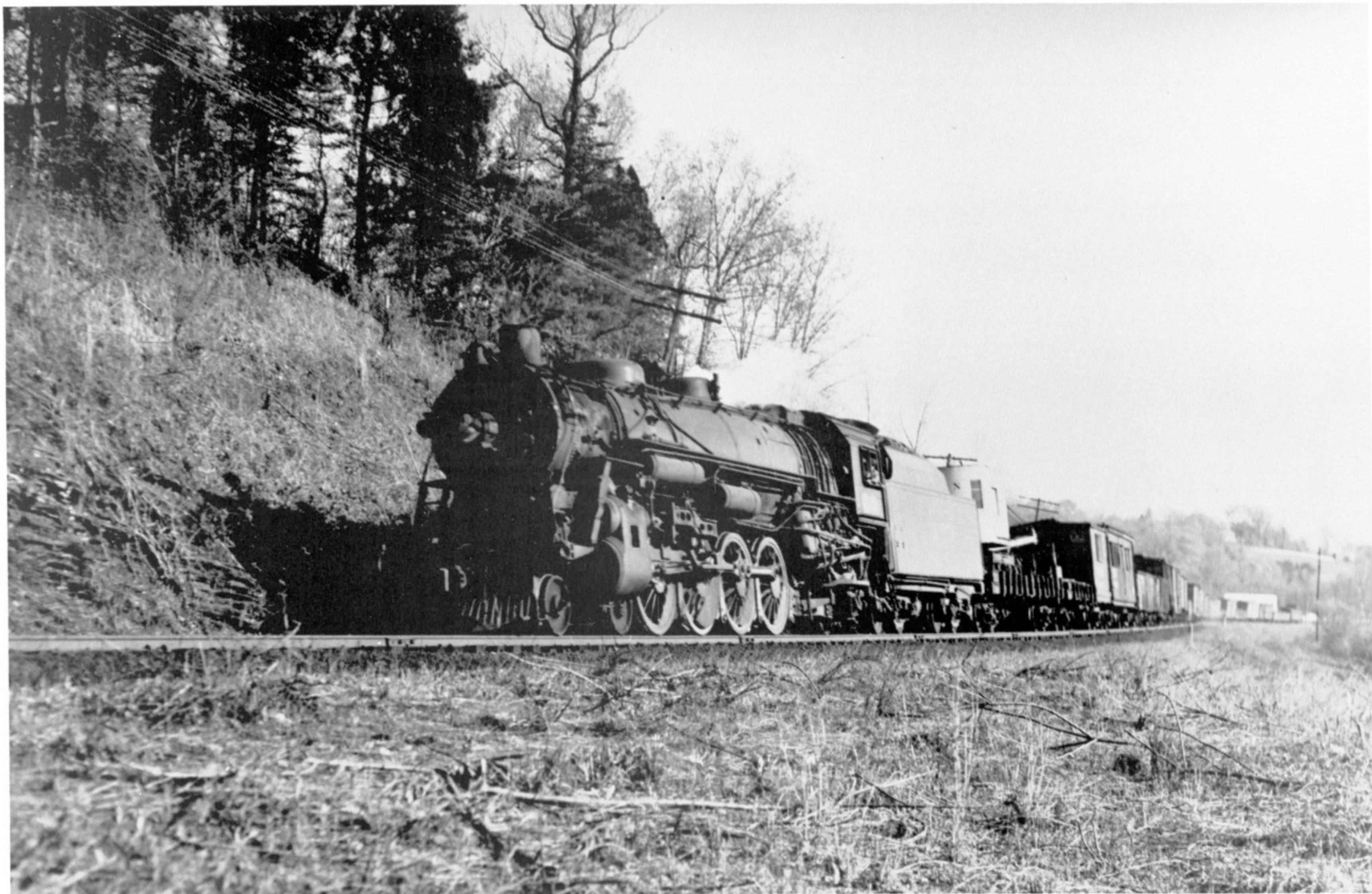
When L&N purchased its L1-class 4-8-2s in 1926 and 1930, heavy passenger service was really what it had in mind for the light USRA-design engines. Late in steam, however, the road found it had an excellent dual-service machine in the lanky Mountains. Number 417 is shown pounding along the Knoxville & Atlanta Division main near Armona, Tennessee in 1951 with a mixed freight in tow. It may not be the Southland or Flamingo, but the L1 is still generating revenue miles for the Old Reliable.