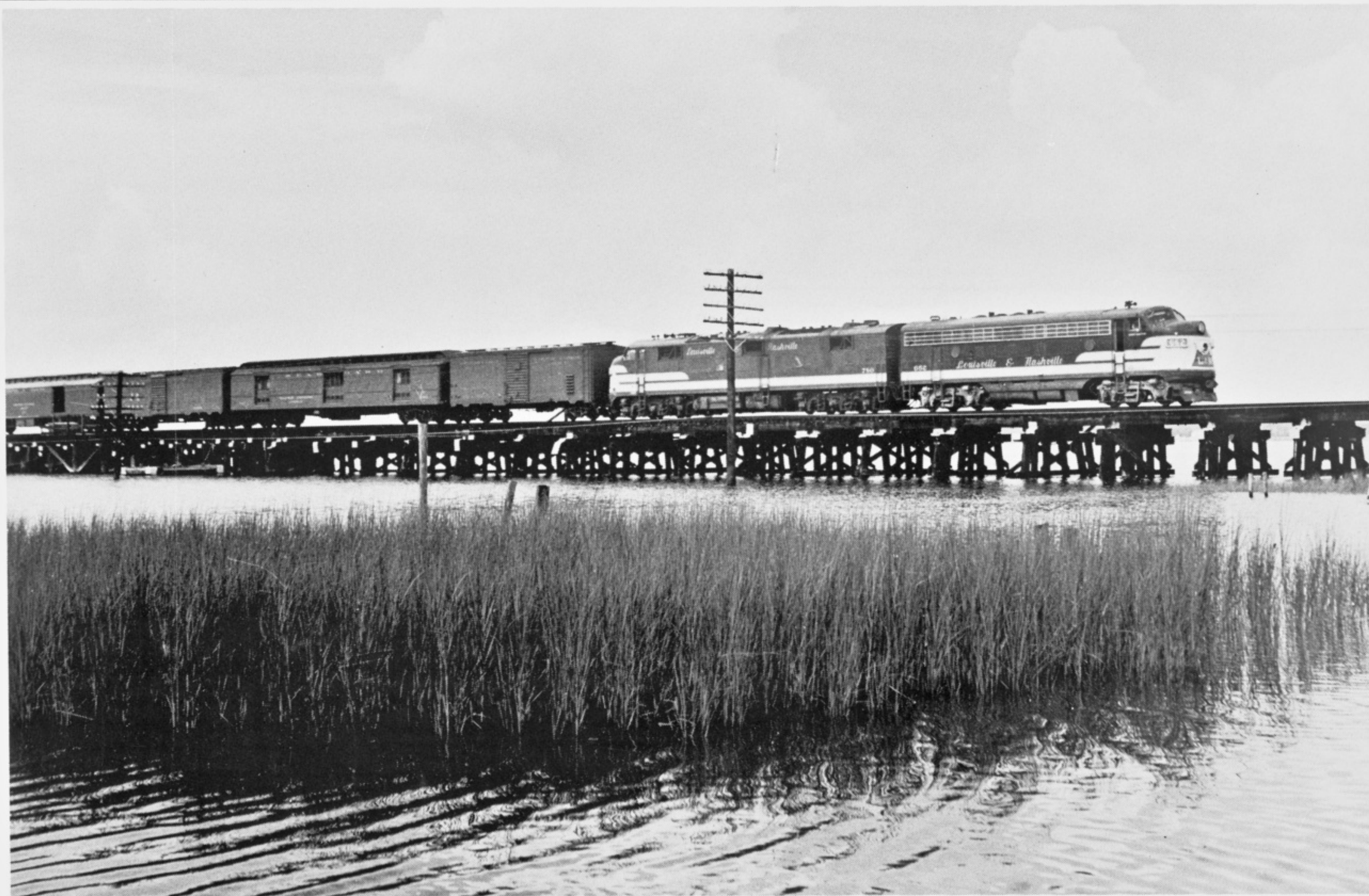
With cumulus thunderheads building in the distance, train 4, the northbound Azalean , rolls across Biloxi Bay in August, 1958. Within a year, the New Orleans - Cincinnati train will have its southern terminus cut back to Montgomery. (J. Parker Lamb)