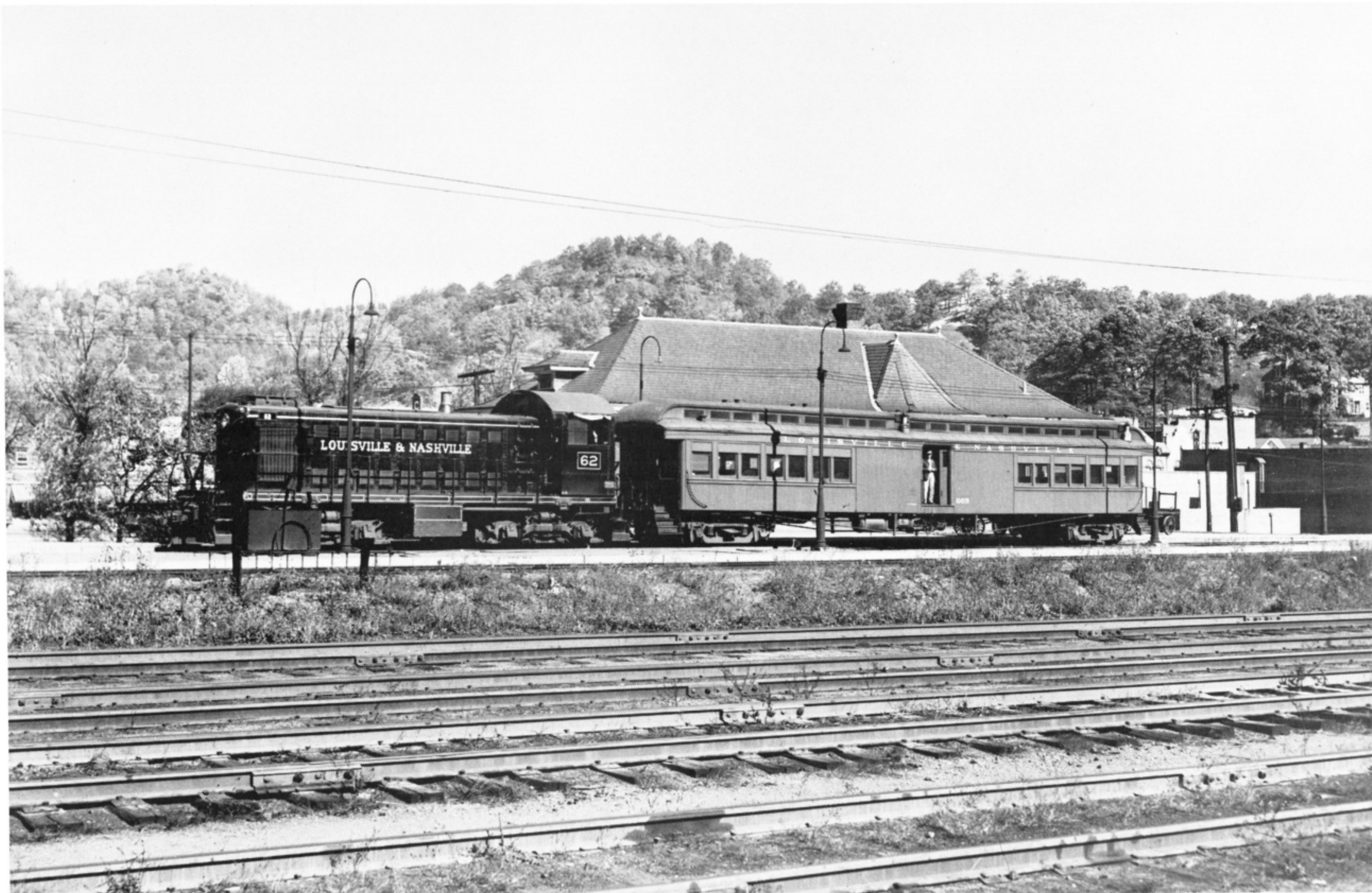
Not all L&N passenger trains were as sleek as the Humming Bird. On August 31, 1953, the remnant of Cumberland Valley Division local #12 prepares to roll north from Norton, Virginia. Until July 21, 1952, the train connected at Pineville, Kentucky with Corbin-Harlan trains 21/22. By severing the connection in Kentucky, the remaining Cumberland Gap to Norton round trip could be covered by Alco S1 #62 and "Jim Crow" combine 668. Not surprisingly, the poorly patronized run expired five months from this exposure.