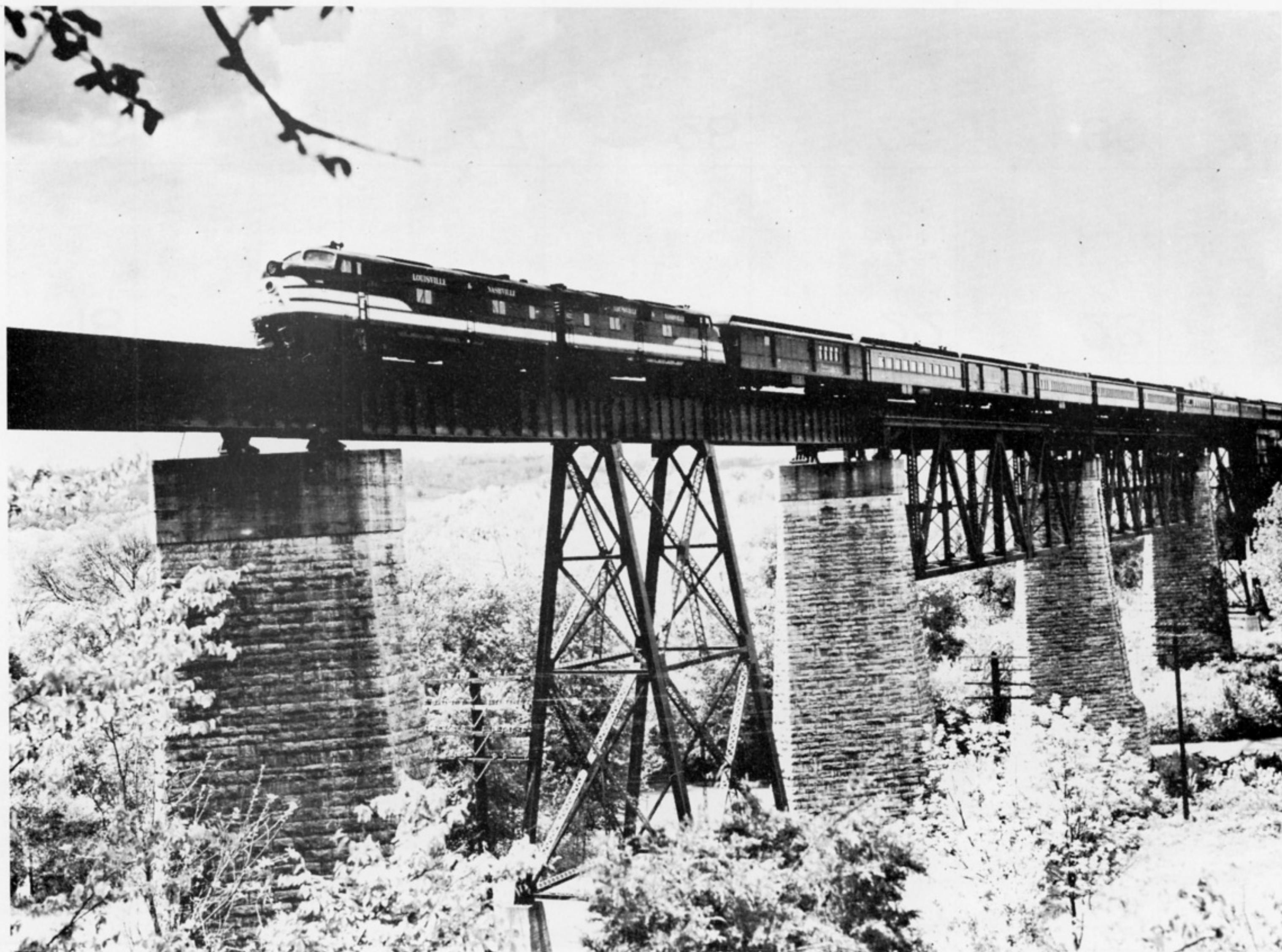
Munfordville, KY June 3, 1949