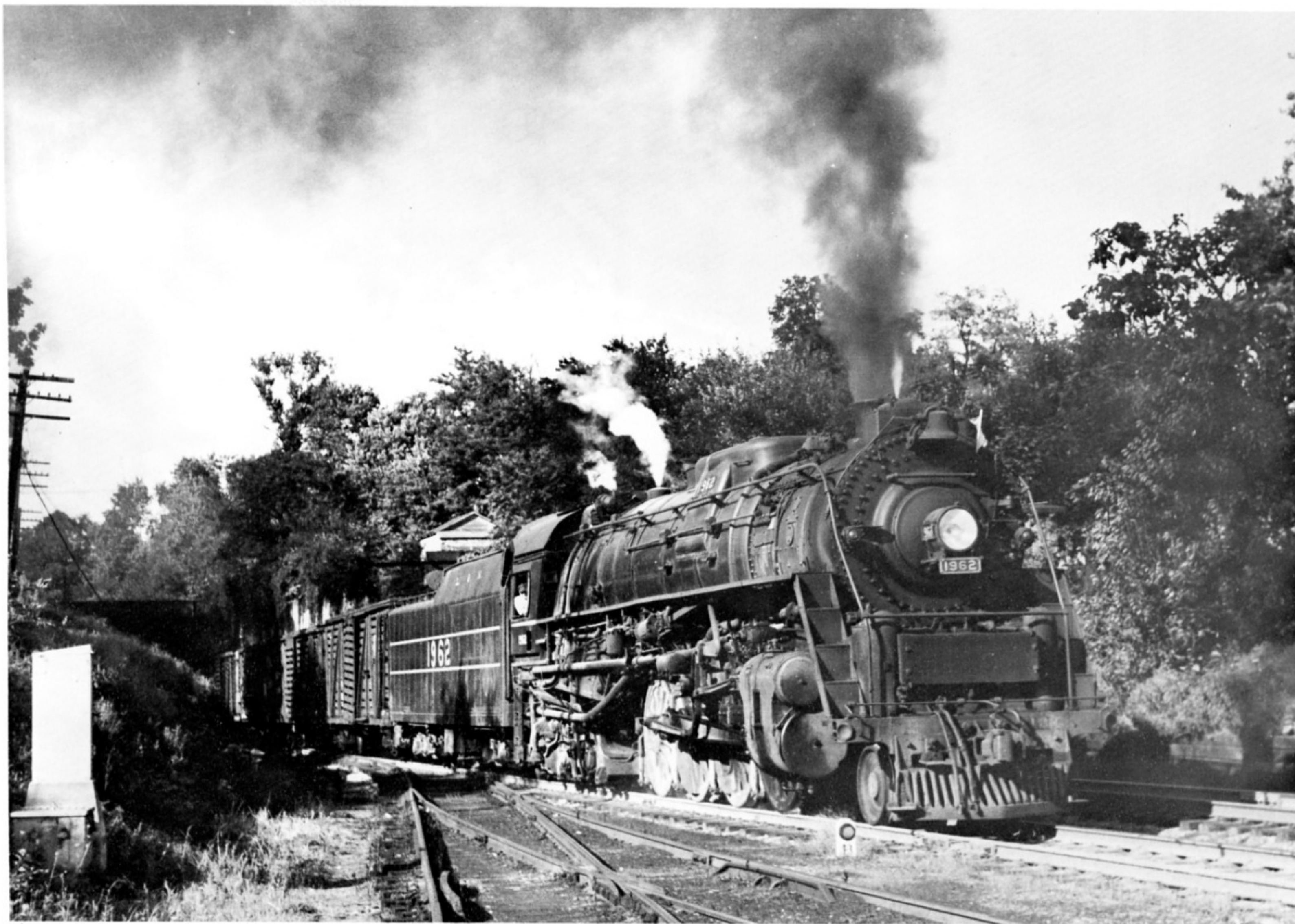
Paris, KY August 17, 1951