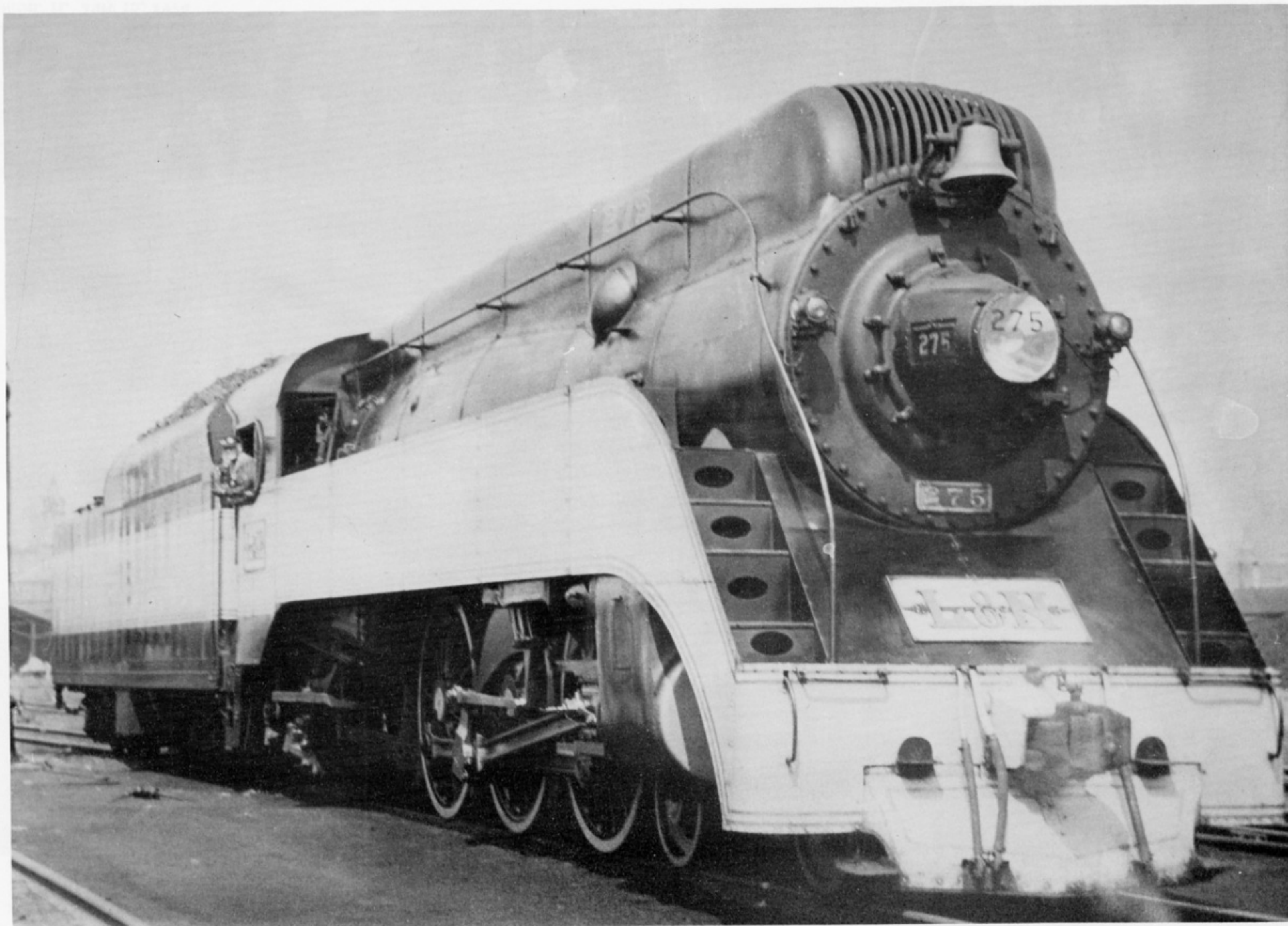
Louisville, KY Date Unknown