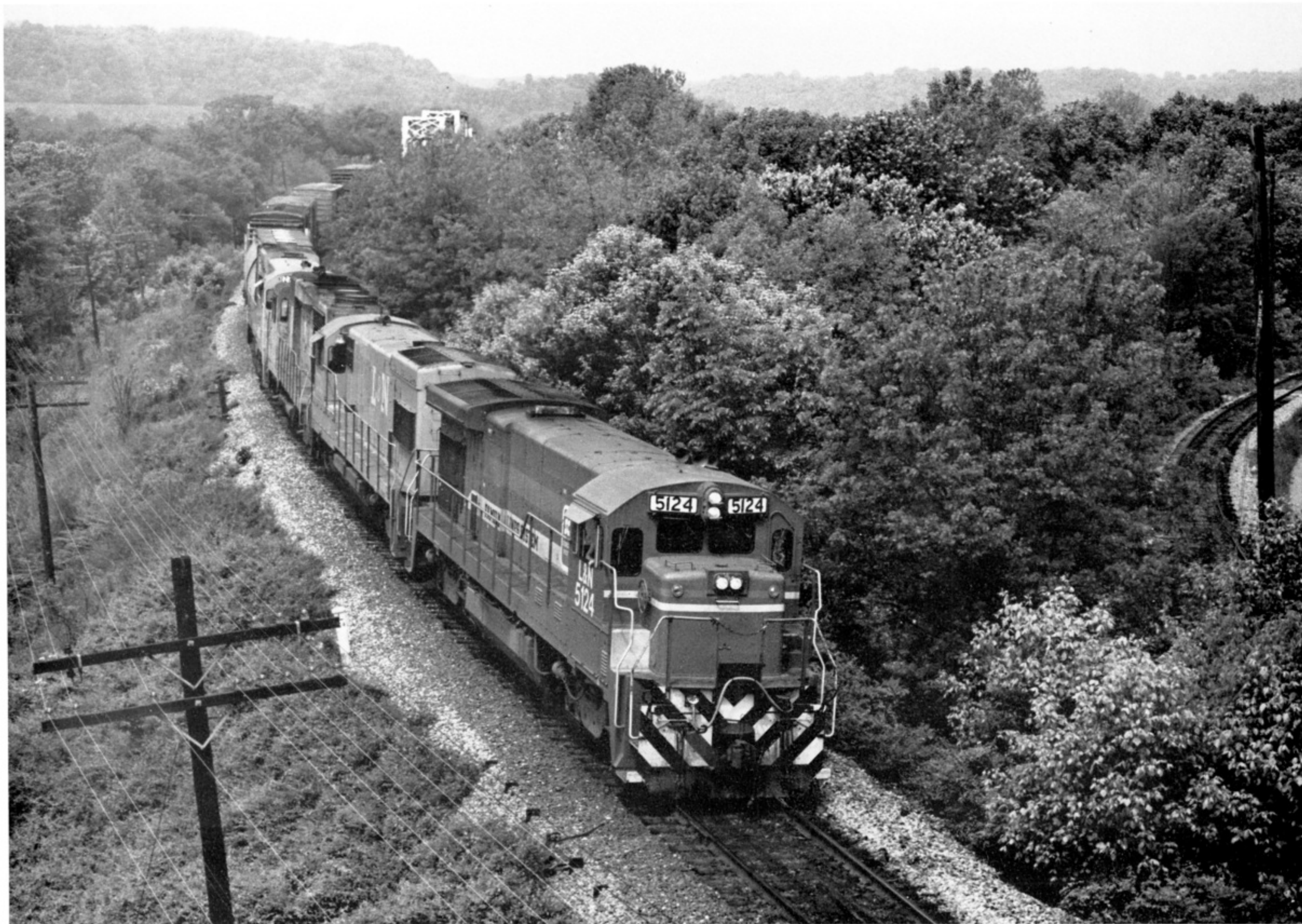
Worthville, KY May 20, 1979